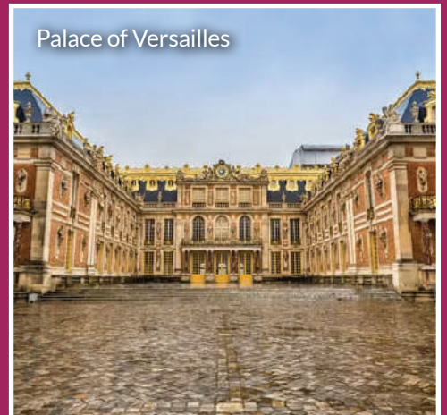
Palace of Versailles